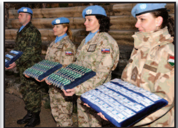
Peacekeepers in Sector 4 took centre stage in the ruins of Salamis in Famagusta where they were decorated with the United Nations medal in recognition of their service in Cyprus.