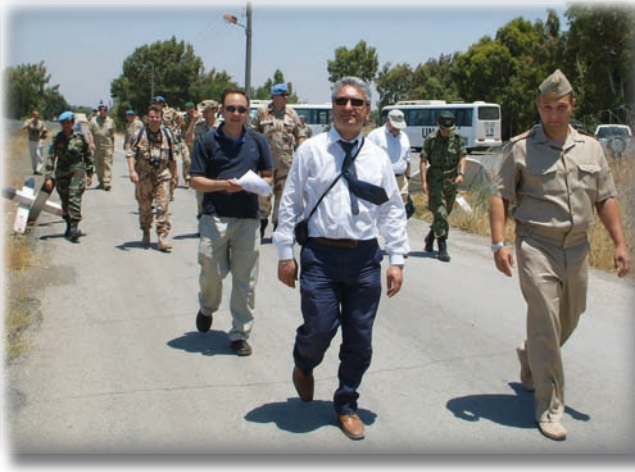
Ambassadors and Military Attachés at the B-Gate

The FC invited the Ambassadors and Military Attachés to Syria and Israel to UNDOF