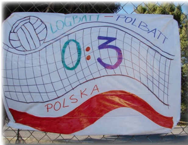
Prophetic banner with final score