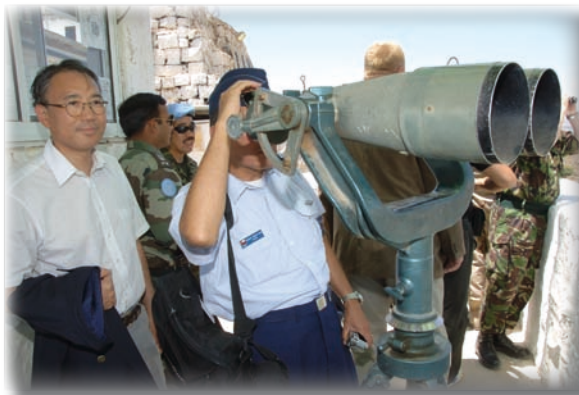
At UNTSO OP 51

UNDOF Line Battalion at POLBATT Posn 60. Exhausted from the heat and volume of information provided, the Ambassadors and Attachés enjoyed the Polish hospitality with a BBQ and drinks before heading back to Damascus.