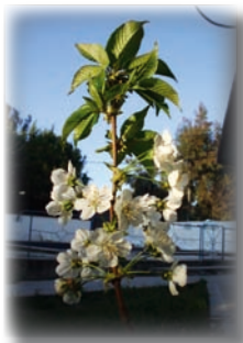
'SAKURA' (cherry tree)

As you know, Club Fuji is located in Camp FAOUAR. Some people call it Fuji House or Fuji Hut. Thanks to your kind