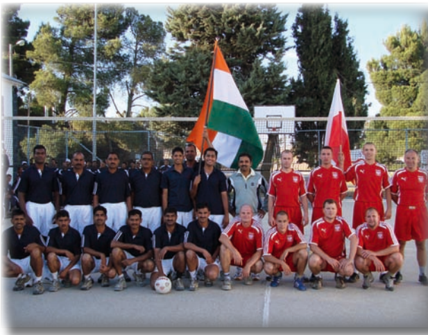
A group photo with the Indian and the Polish Flags

one after another. The third set looked similar. The Indian team was shattered, being unable to find a solution for breaking in. Nothing could snatch a victory away from the hands of Polish soldiers. In effect they totally defeated the Indian's team 3:0 in sets.