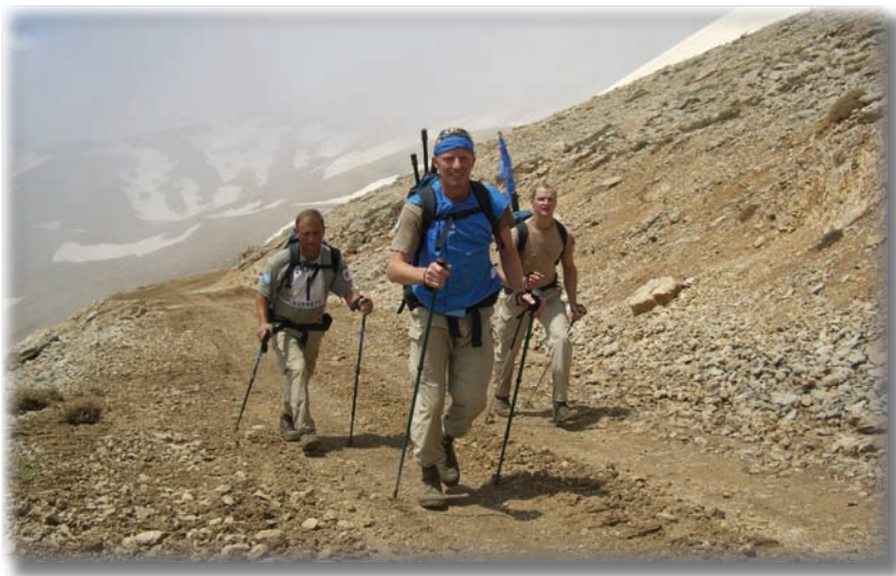
Final countdown from Posn Hermon Base to Posn Hermon Hotel (2814 m)