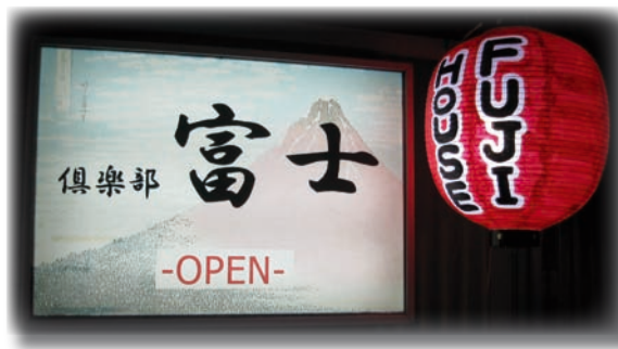
'AKACYOUCHIN' (red lantern, traditional sign of bar)

between people from different countries and cultures. Although it is usually difficult to speak in English, when drinking together, everyone communicates at ease. Club Fuji offers Japanese Sake (hot or cold) and three kinds of beer, we also serve Japanese snacks: 'Wasabi & Kakinotane.'