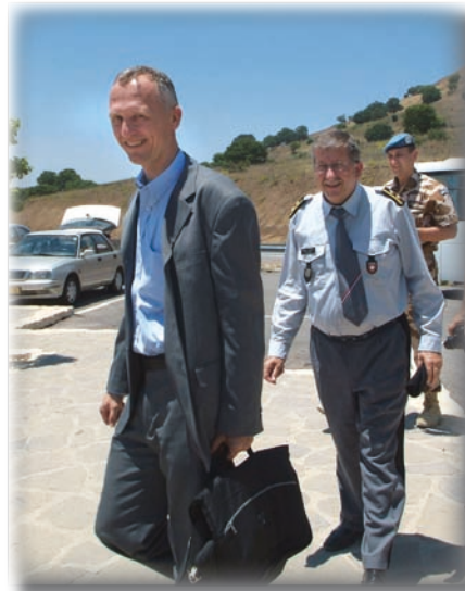
Where is the next briefing ?

All participants - altogether 45 Excellencies and 30 Attachés - confirmed the value of the visit and how much they enjoyed their stay with UNDOF. They urged MGen Jilke to continue with this activity on a regular basis.