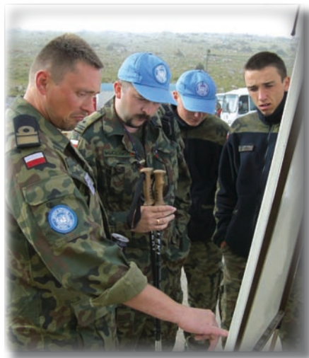
Polish patrol having a look at the map

The predicted weather forecast for the two days announced thun-