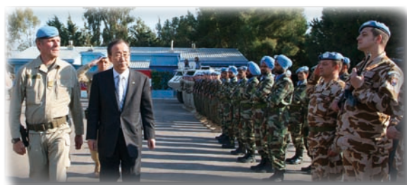
FC and SG Inspecting the Troops

that one of his first diplomatic involvements within the UN was related to the establishment of UNDOF in 1974. He thanked all members of UNDOF for doing an excellent job in keeping peace in