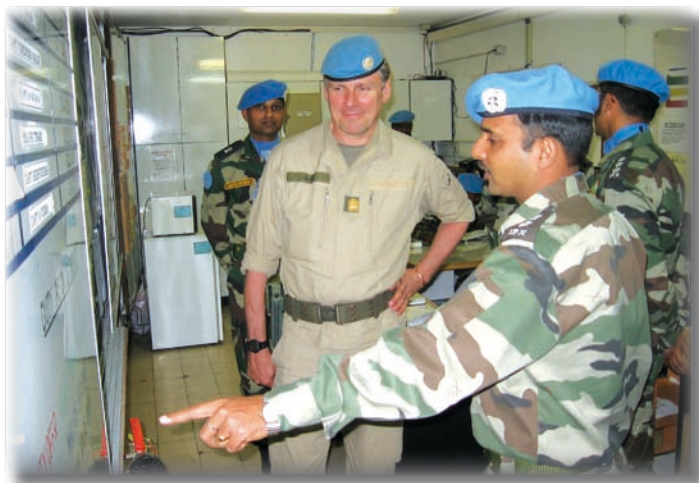
CO/LB introducing his team to the FC