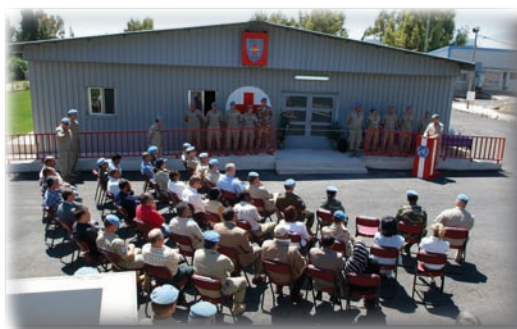
The audience listens to the FC's address

Based upon combined efforts at the final stage of the project the inauguration ceremony of the new Medical Center took place at Camp Faouar on 23 rd May 2007.