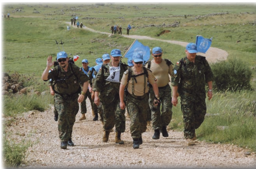
COS leading his Patrol exemplarily

This unfavorable forecast urged the organizing team to plan and