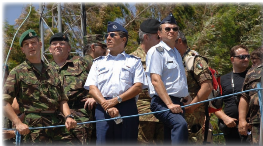
Area of Responsibility of POLBATT - Posn 22