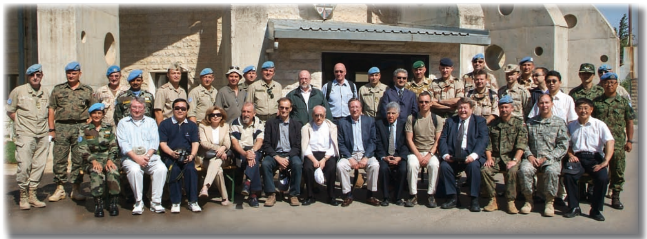
14 th June 2007 - Altogether 17 Excellencies and 14 Attachés

The distinguished guests got a final briefing on the tasks of an