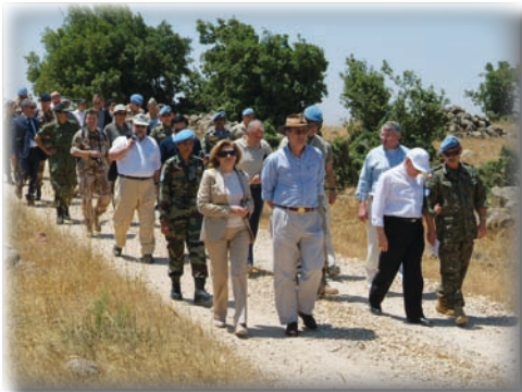
Visit of Ambassadors and Military Attachés on B-Side. UNDOF briefing at CF and tour through the AOS. (14 th Jun 2007)