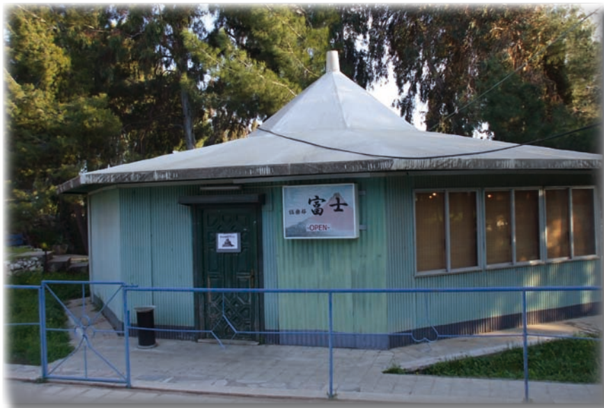
'Club Fuji' Camp FAOUAR

After a few drinks, and good conversation, we are better prepared for the next day to come! Fuji Club offers an environment that promotes friendship and better understanding