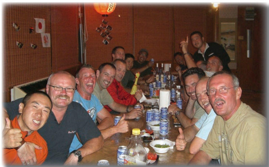
'We are friends'

It would be our great pleasure to welcome you to Club Fuji. Stop by, have a drink and get to know us. We are waiting.