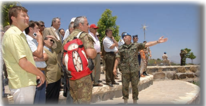
Visit of Ambassadors and Military Attachés on A-Side. Briefing on UNDOF activities and introduction tour in AOS/AOL. (19 th Jun 2007).