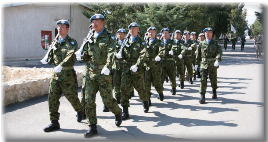
Japanese Contingent marching by Ban Ki-moon

Before the SG left Camp Faouar, the local Civilian staff presented