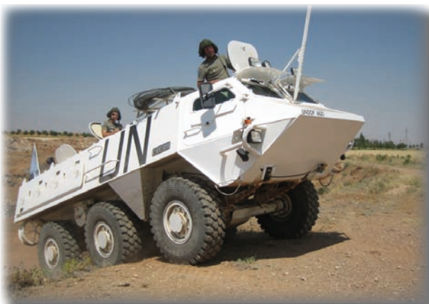
SISU managing difficult grounds