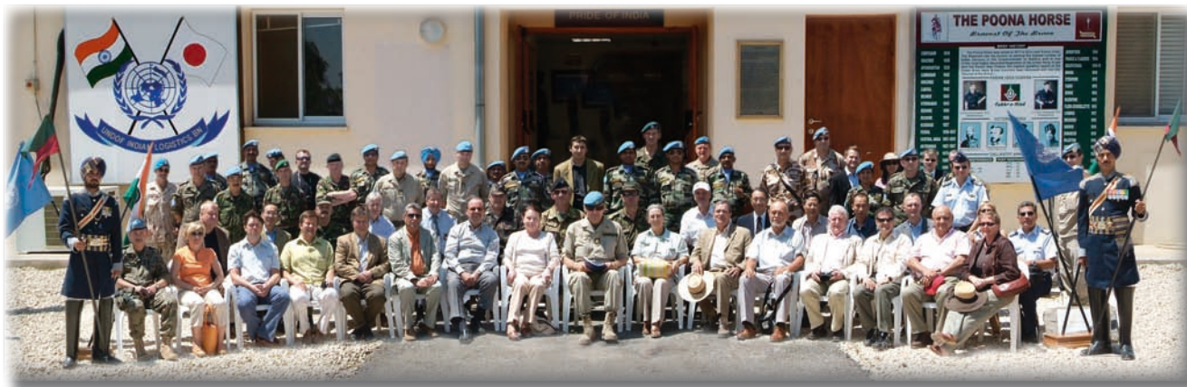
19 th June 2007 Group Picture in Camp Ziouani

UNDOF Line Battalion at POLBATT Posn 60. Exhausted from the heat and volume of information provided, the Ambassadors and Attachés enjoyed the Polish hospitality with a BBQ and drinks before heading back to Damascus.