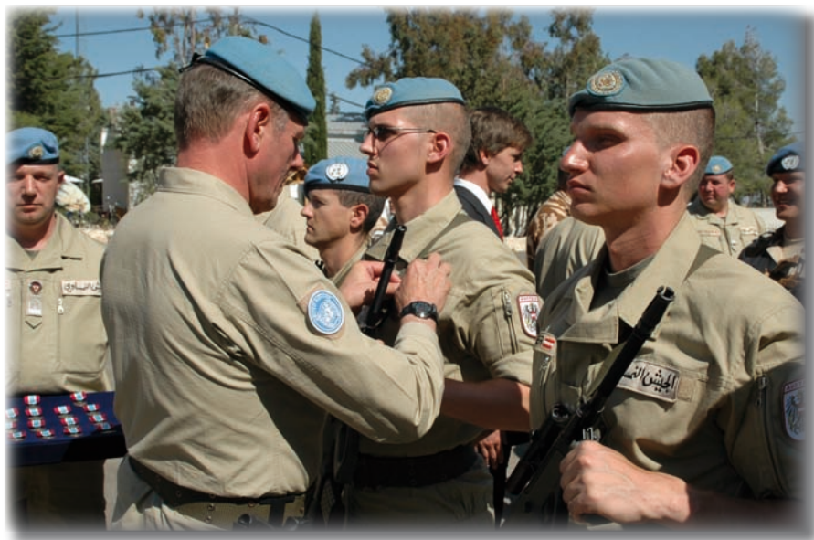
The FC bestowing the medals