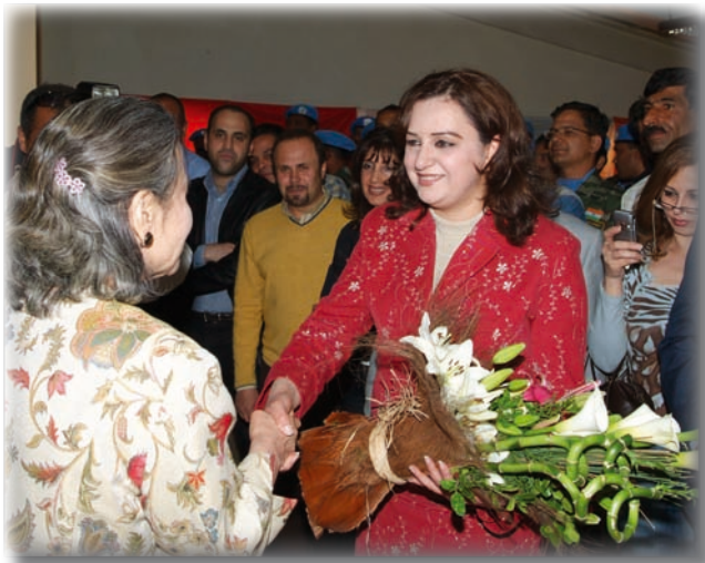
Civilian Staff present flowers to Mrs Yoo Soon-taek

him a typical gift from the region. All available soldiers and civilians waved farewell to the SG, wishing him and his entourage a safe trip back to New York and good luck for the demanding tasks ahead. SG, Ban Ki-moon, thank you once again for visiting UNDOF.