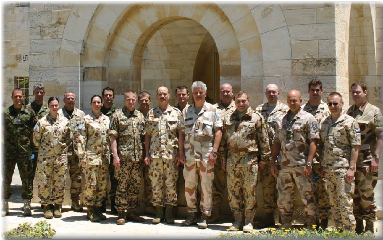
New UNMOs in Souk Hamedieh - Training Damascus

On the 15 th Jun 2007, 16 new UNMOs arrived to UNTSO HQ Jerusalem from 13 different countries. Four of them were transferred to Observer Group Golan-Damascus (OGG-D).