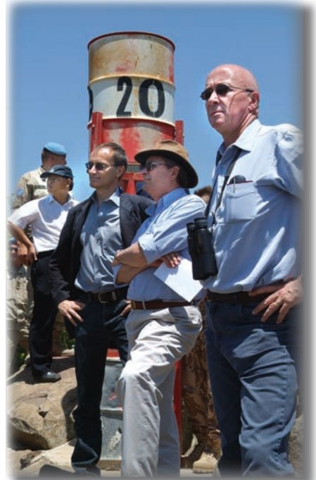
At Barrel 20

At OP 72 the party enjoyed a briefing on the UNTSO mandate and the tasks and life of a Military