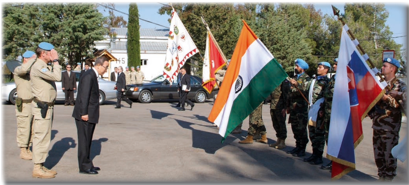
FC and SG salute the colours of the TCC

a really troubled area of the globe. He also emphasized the necessity to continue the mission to a peaceful resolution of the conflict and congratulated UNDOF for doing this in a rather unpretentious way during the last 33 years.