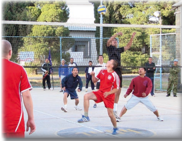
A focus on a serious, but fair fight

During the second set the Polish block prevented the Indians from taking over the initiative whereas attackers were most effective executing ball smashes