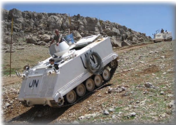
M-113 in action, or how to get 'Grey Hair' at 'Mount Hermon'

Three weeks later a total of 17 Austrian and Slovakian drivers successfully completed the SISU courses and will now be the responsible persons for conducting APC patrols in UNDOF's Area of Responsibility. The other APC training course was conducted in the area of